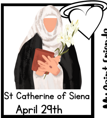
St Catherine of Siena April 29th

How can we bear fruit for Jesus? Write or draw your ideas here!