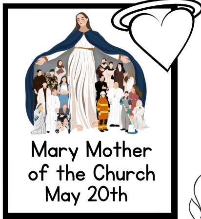
Mary Mother of the Church May 20th