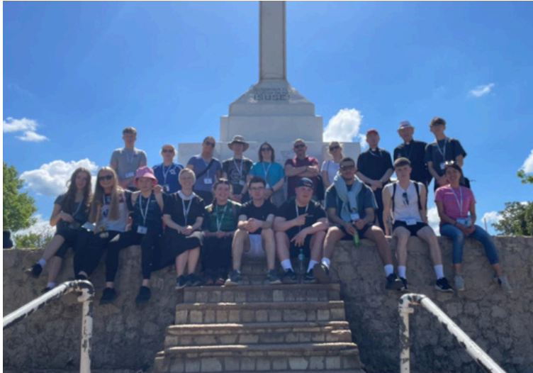
Pope John Paul II Pilgrimage to Medjugorje! The group at the top of Cross Mountain at the end of April! Can't wait for next year already!

Download from www.waterfordlismore.ie/resources or subscribe to receive by email!