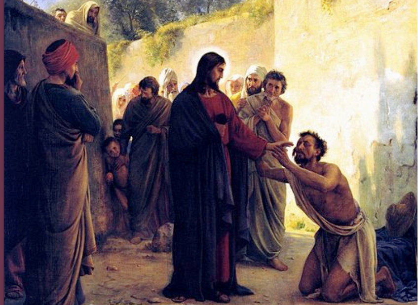
Healing of the Blind Man by Jesus Christ, Carl Bloch