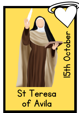
St Teresa of Avila