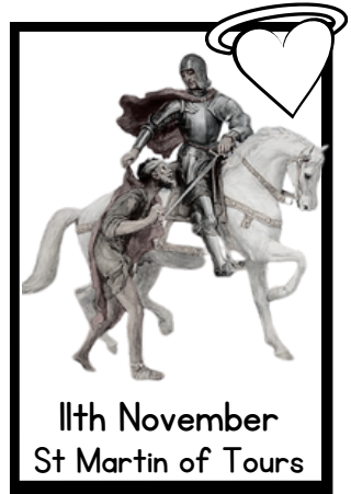
11th November St Martin of Tours