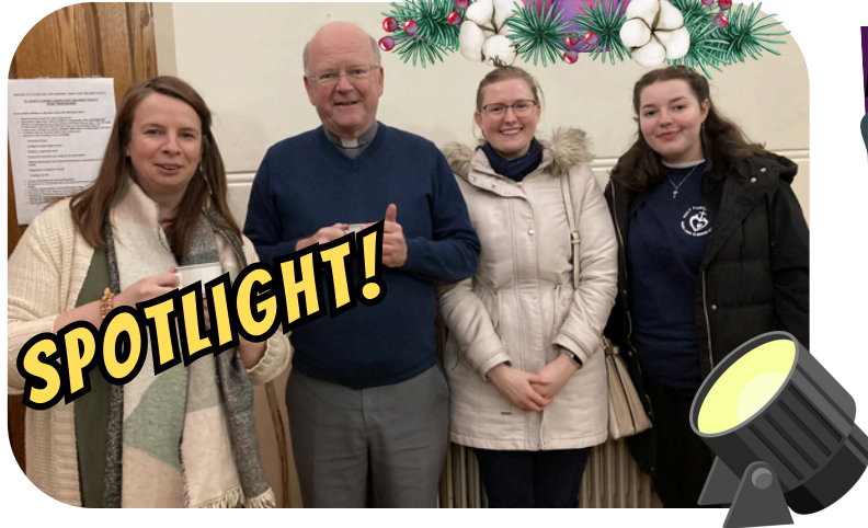
Encounter for Young Adults at St John's Church Waterford on Friday night. For more info on youth and young adults events, check out www.waterfordlismore.ie/youth-ministry

Download from www.waterfordlismore.ie/resources or subscribe to receive by email!