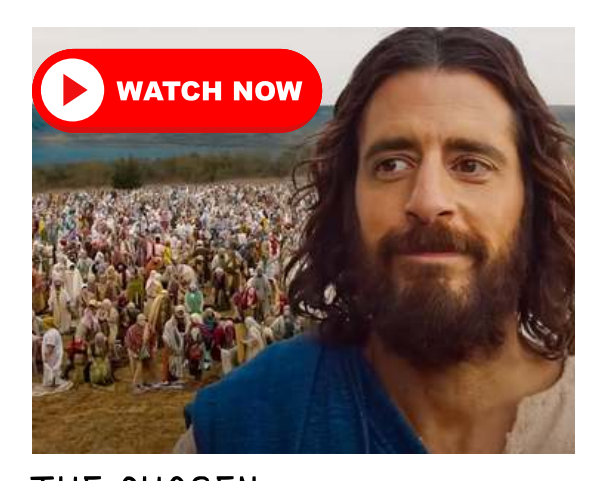
THE CHOSEN (THE SERMON ON THE MOUNT)

To the Heights Youth Resource also available