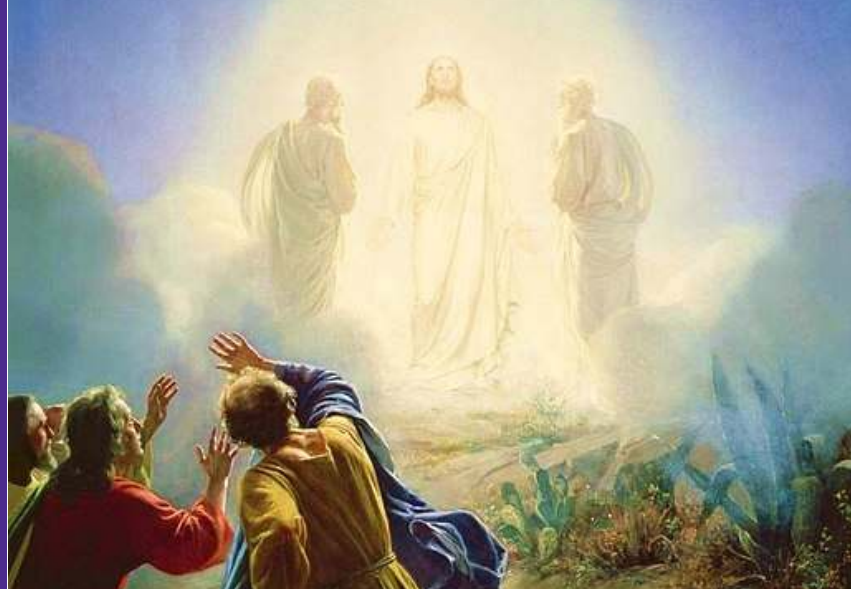
Carl Bloch, Public domain, via Wikimedia Commons

'THIS IS MY SON, THE CHOSEN ONE. LISTEN TO HIM.'