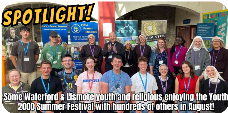
Some Waterford & Lismore youth and religious enjoying the Youth 2000 Summer Festival with hundreds of others in August!

Download from www.waterfordlismore.ie/resources or subscribe to receive by email!