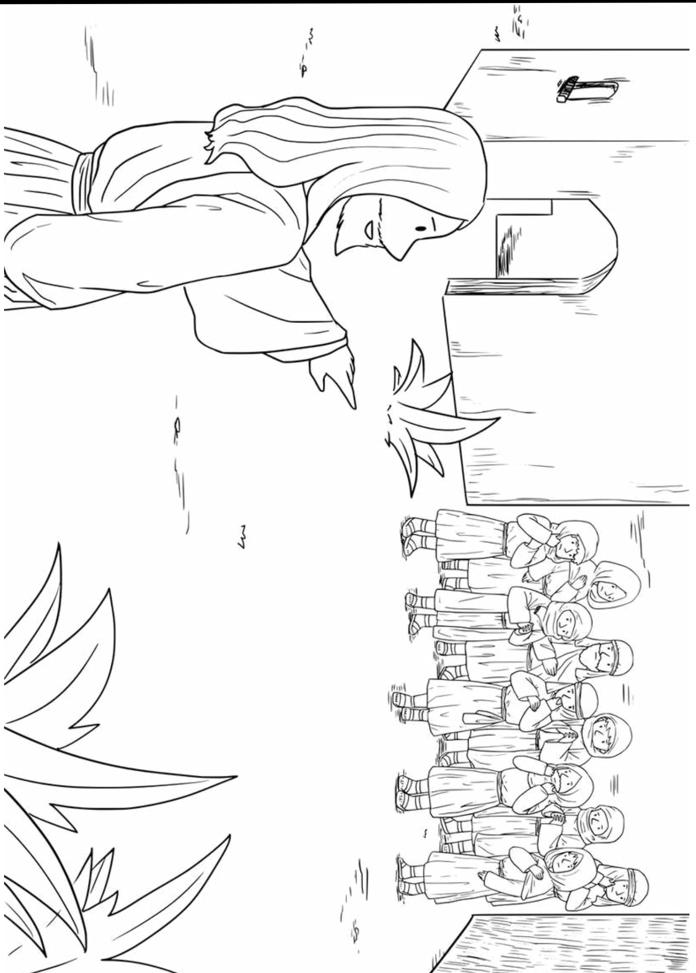
Luke 17: 11-19