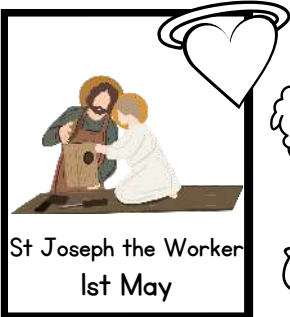
St Joseph the Worker 1st May