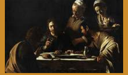
Caravaggio

If you don't have a Bible handy, click here to access Sunday Mass Readings!