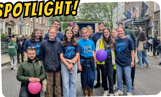
HOLY FAMILY MISSION SUPPORTING THE PRO-LIFE MARCH FOR LIFE IN DUBLIN RECENTLY.