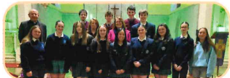
Some of the youth who travelled on pilgrimages with the Diocese last year receiving their Pope John Paul II Award in March 2026.

Thirty-five Parish Faith Reps are currently commissioned and receiving ongoing training to volunteer with youth in their parishes and the fruits are already evident: Youth Groups are currently up and running in Dungarvan, Clonmel and Ballyporeen. Youth Adoration is happening in a number of parishes and schools both monthly and weekly. Pope John Paul II Award participants are volunteering as readers, greeters, in choirs, at parish coffee mornings and more. The annual REvive Conference for Senior Cycle students at SETU Arena drew almost ninety students from across the diocese. The annual "Called to Greatness" workshop for JP2 Award participants drew forty students from five schools to reflect on vocations. Holy Family Mission are facilitating Confirmation and post-primary retreats for schools around the diocese. Alpha Youth has been running in two post-primary schools.